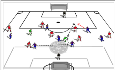
© Copyright NSCAA 2014 1/2 field game with less than full width. Play 7v7 or whatever numbers work and put 1 or 2 GKs in the midfield. They can use their hands and every attack must go through them. Coach distribution, communication and when shots are created, coach the keepers in goal.